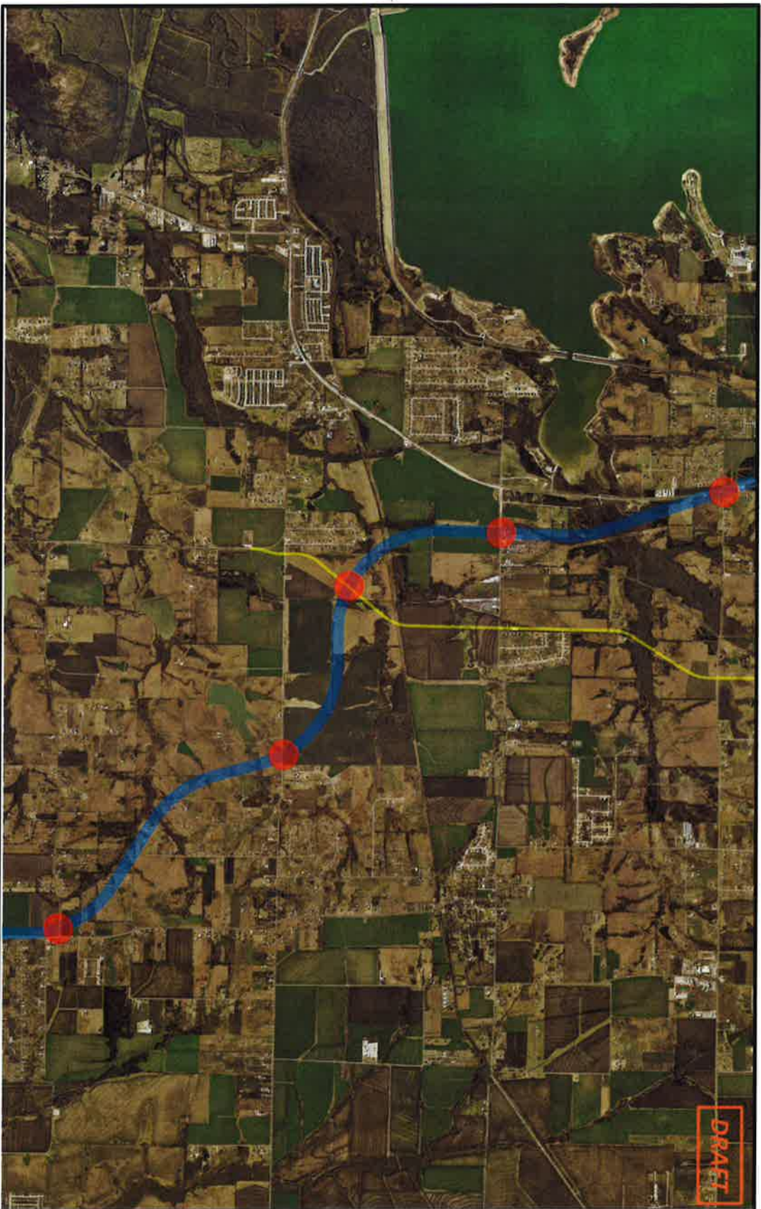
Proposed Freeway Alignment Option FM 3549 Extension Grade Separation/Interchange